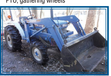
*1993 Ford model #1920 diesel tractor, open station, 1100 one owner hours, FWA, 3 pt, sells with Ford loader, nice unit