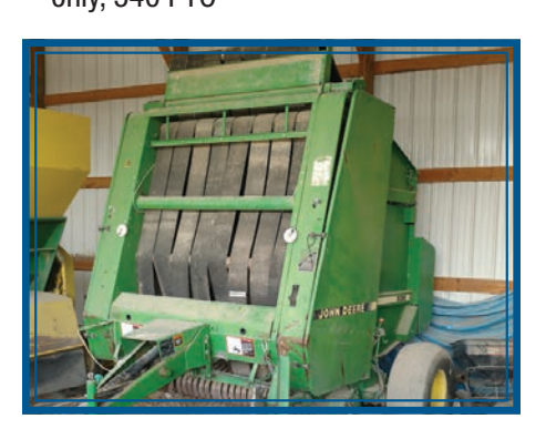
*1995 John Deere #535 big round baler. net wrap, shedded, good belts, 1000 PTO, gathering wheels