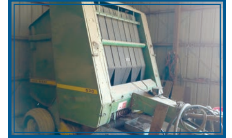
*1983 John Deere #530 big round baler, one owner, shedded, new belts, twine only, 540 PTO