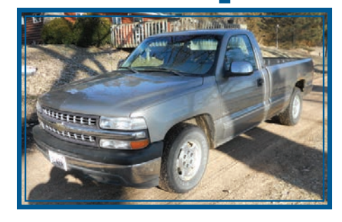
*2000 Chevrolet 1500 pickup. 8 ft. bed, V-8, auto, 162,000 one owner miles

5X8 2 wheel trailer for ATV or mower Chevrolet 34 ton pickup box trailer