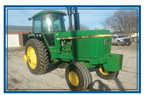
*1981 John Deere 4840 diesel Tractor 3 hyd. cab, new air, front weights, 42" rear rubber, rear wheel weights, motor and trans OH, farmer owned, nice