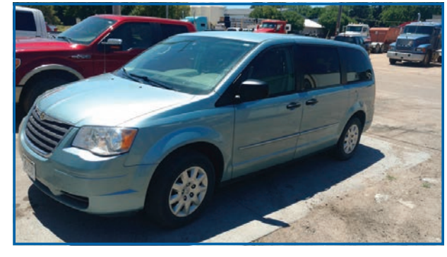
*2008 Chrysler Town & Country Van, bucket seats, 3rd row seats, loaded, clean, 138,000 miles